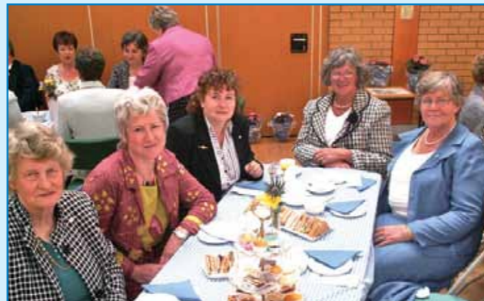
Representatives from Hillsborough's link branch in Blessington, Co Wicklow