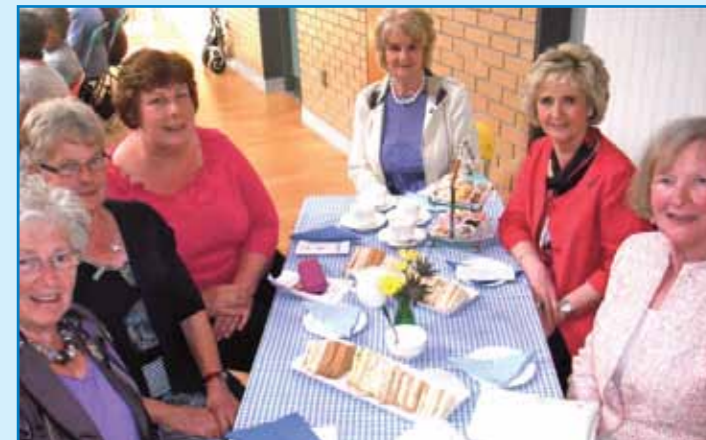
Ladies from Hillsborough Parish prepare to take tea